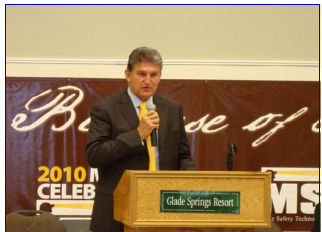
Governor Joe Manchin provided opening remarks for the 2010 Miners Celebration

The WVBAC continues to spread the word about brownfield redevelopment opportunities across the state. In June the WVBAC participated in the 2010 Miners' Celebration at Glad Springs Resort near Beckley, as part of a panel discussion on alternative reuse of surface mine land. The panel included presentations and discussions on a wide variety of surface mine reuse topics, including renewable energy research on wind, bio-mass, and solar, establishment of bee hives and related business opportunities, and innovative reforestation practices.