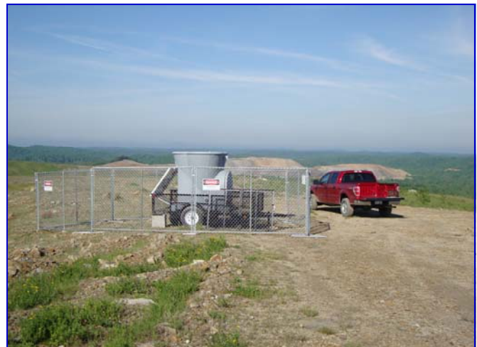
Sonic Ranging and Detection Equipment performing wind analysis data collection at International Coal Group's Webster County surface mine complex

While International Coal Group is currently mining in one area, the SODAR unit is collecting valuable data from a nearby reclaimed ridge top. After it has been determined that sufficient data has been obtained from this site, the SODAR unit will be moved to another surface mine location, the location still to be determined, for the next study.